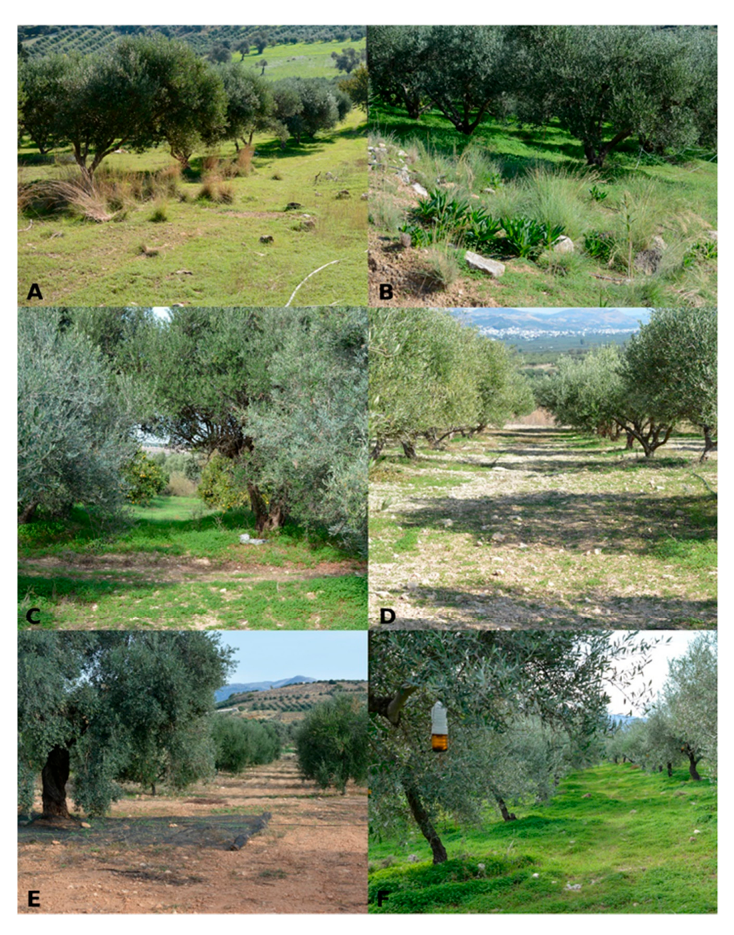
Figure 2. Photos of some of the olive orchards under investigation (numbering follows Table 1). ( A ) olive orchard 20. ( B ) olive orchard 30. ( C ) olive orchard 50. ( D ) olive orchard 5c. ( E ) olive orchard 11c. ( F ) olive orchard 11o.

We counted 37 species, three (3) subspecies and two (2) undescribed species during the bibliographic research distributed in the four UTM grid cells (Table S1). 16 of 37 species (43%) are also present in the orchards. Two species found in the olive orchards, i.e., Caracollina lenticula (Michaud, 1831) and Xerotricha conspurcata (Draparnaud, 1801) (Figure 3A,B), are recorded for the first time in the study area.