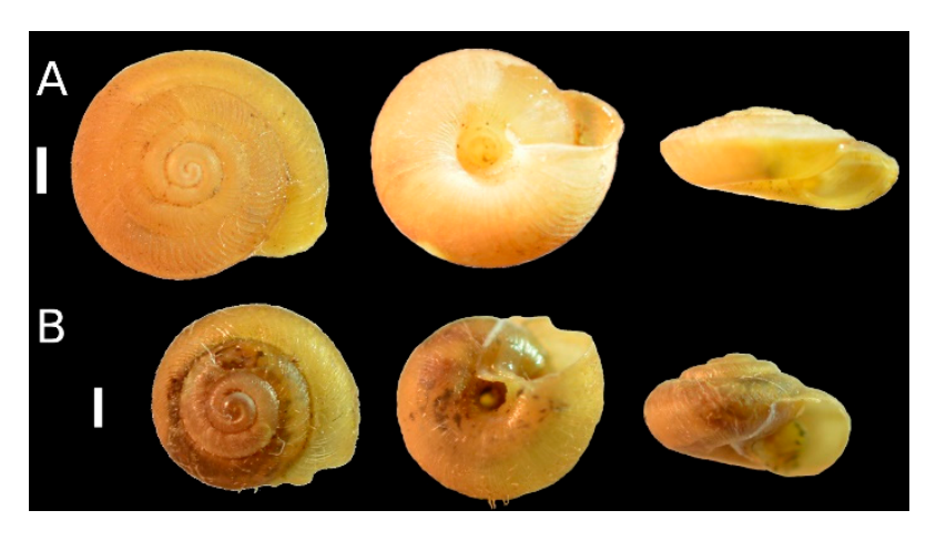
Figure 3. ( A ) Caracollina lenticula (Michaud, 1831), ( B ) Xerotricha conspurcata (Draparnaud, 1801). Scales bars correspond to 1 mm.