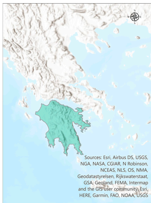
Scheme 1. Case study area: The Peloponnese peninsula in southern Greece.

descriptions found in the text. The area of Mani (Supplementary Material, Map S2) was excluded, since the route was already made available by Ref. [17].