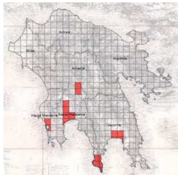
Figure 4: The distribution of the six species of birds mapped at the local level.

Nineteen out of 21 mammal species (90,5%), all 58 birds (100%) and 27 out of 29 reptiles/amphibians recorded from the Peloponnese (93%) were identified and assigned to current taxonomic nomenclature. Four mammals, 2 reptiles and one amphibian were excluded from the database for the same reasons explained for plants above. All registered occurrences have been located on the map according to the level of detail of the description of the geographic location (Tab. 1). Only few animal species were recorded at the local level (Fig. 4).