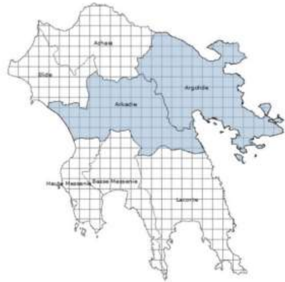
Figure 3: The distribution of Eurasian jay ( Garrulus glandarius ) in Arkadie and Argolide administrative units of 1828.

This process left 983 species that have been geo-located (Figs. 1, 3 and Tab. 1), the majority of which have been mapped in the local scale. It is noted that a species might be located in more than one area of different levels of detail according to the description in the texts (e.g., a species is present in Kalamata city and in the administrative unit of Argolide).