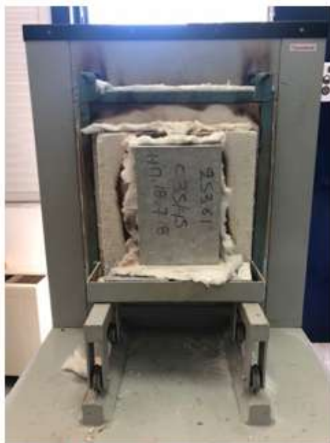
Figure 1 : Set up of fire test

curves employed in several international standards. For this test a 30 cm x 1 cm x 5 cm specimen was prepared. The test was performed 28 days after the production of the specimens.