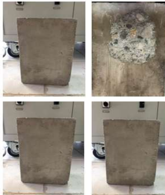
Figure 3: a) Spalling phenomena at C35/45 after 600°C, b) No Spalling phenomena at C35/45 after 500°C,

In general, in order to avoid spalling phenomena at the concrete various methods of passive fire protection have been developed which however have not yet been applied to metro tunnels. At this point it should also be mentioned that apart from the concrete steel rebars necessitate protection because at temperature over 600 °C loose part of their load bearing capacity.