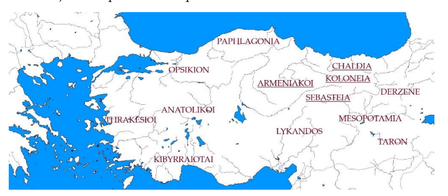
[Figure 1: Map of Byzantine Asia Minor. The Pontic themes are underlined.]