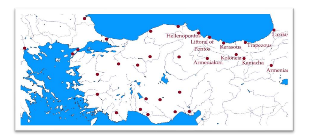
[Figure 5: Map of the apothēkai where the kommerkiarioi under consideration were active.]

From the remaining non-thematic officials, it is important to mention the dioikētēs of Neokaisareia, the episkeptitēs of Tefrikē, the archōn of Kerasous, and the officials in Amisos: dioikētēs , ōrreiarios , chartoularios , parafylax , and tourmarchēs . The ōrreiarioi in particular were rather numerous in the last quarter of the 10<sup>th</sup> and the first quarter of the 11<sup>th</sup> c.